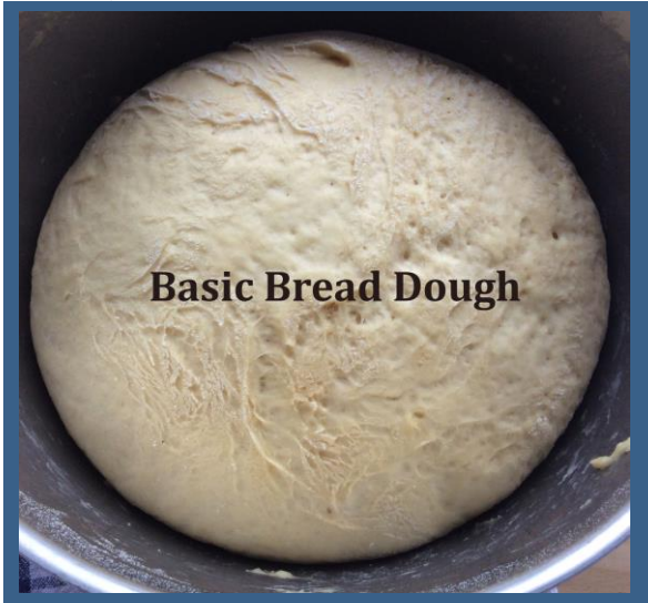
Basic Bread Dough